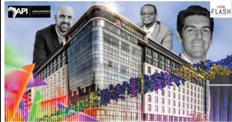
The African Property Investment (API) Summit, set to take place on 10th and 11th October 2023 at the Marriot Hotel in Melrose Arch, is des a resounding success as the world-class event enters its 14th year.