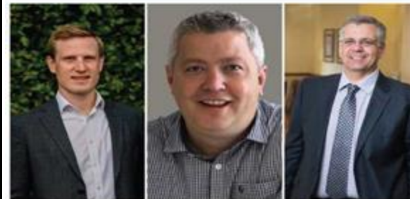
The much-awaited Africa Proptech Forum is set to kick off on 11 October 2023 at the Marriot Hotel, Melrose Arch in Johannesburg, South Africa. Presented by industry giants M80 Software, BrodtTech, and Ademy's, this event is a beacon of opportunity for decision-makers in both the technology and formal property sectors across the African continent.